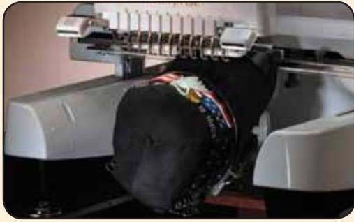
Wide Cap Frame Set - 14" x 2-3/8"

No matter where your creativity takes you, Baby Lock has an optional Enterprise accessory that gets you there.