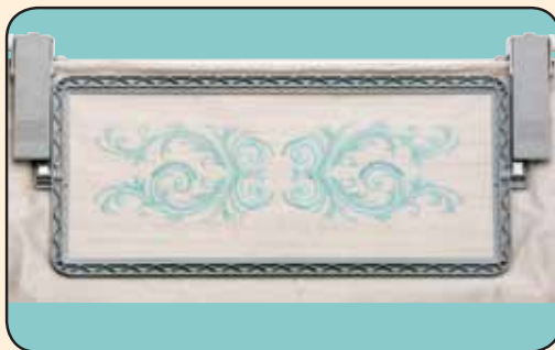
Continuous Border Hoop - 4" x 11-3/4"