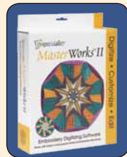
MasterWorks II Digitizing Software