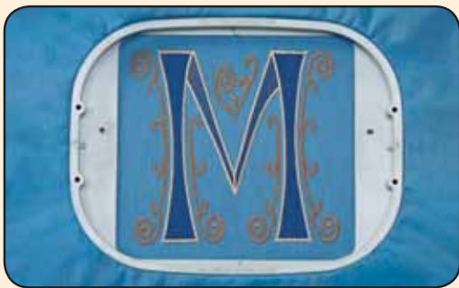
Quilt Hoop - 8" x 8"