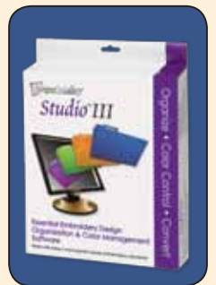
Studio III Cataloging Software