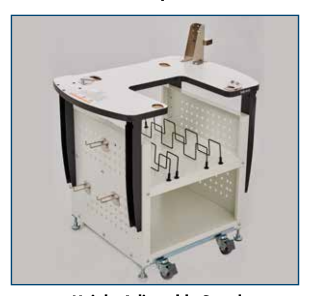
Height Adjustable Stand