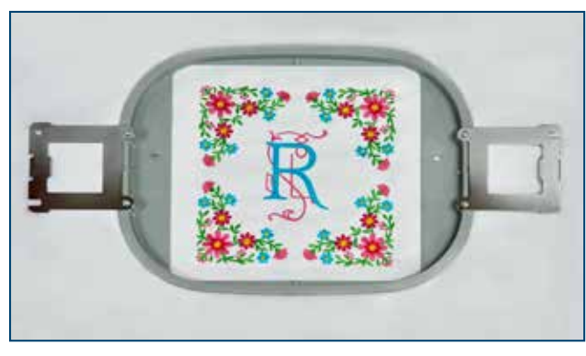
8" x 8" Hoop