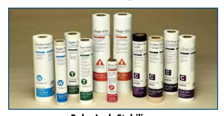
Baby Lock Stabilizer

Discover the perfect friend for your machine with three years of service and support through the optional Gold Standard program.