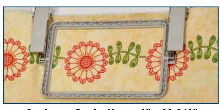
Continuous Border Hoop - 4" x 11-3/4"