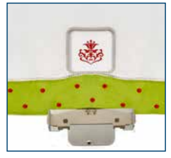
2" x 2" Hoop