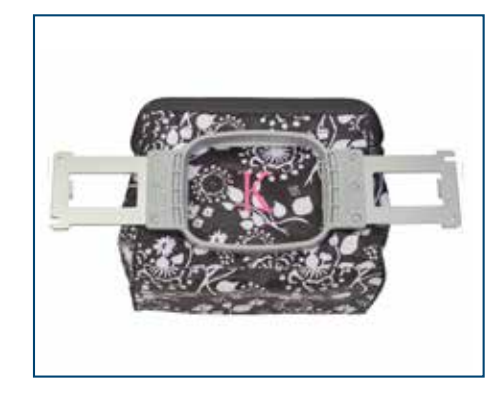
4" x 4" Hoop

The Alliance comes with six embroidery hoops, ranging from the nimble 1-1/2'' \times 1-3/4'' hoop all the way up to 8" x 8".