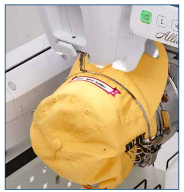
Advanced Cap Frame Set