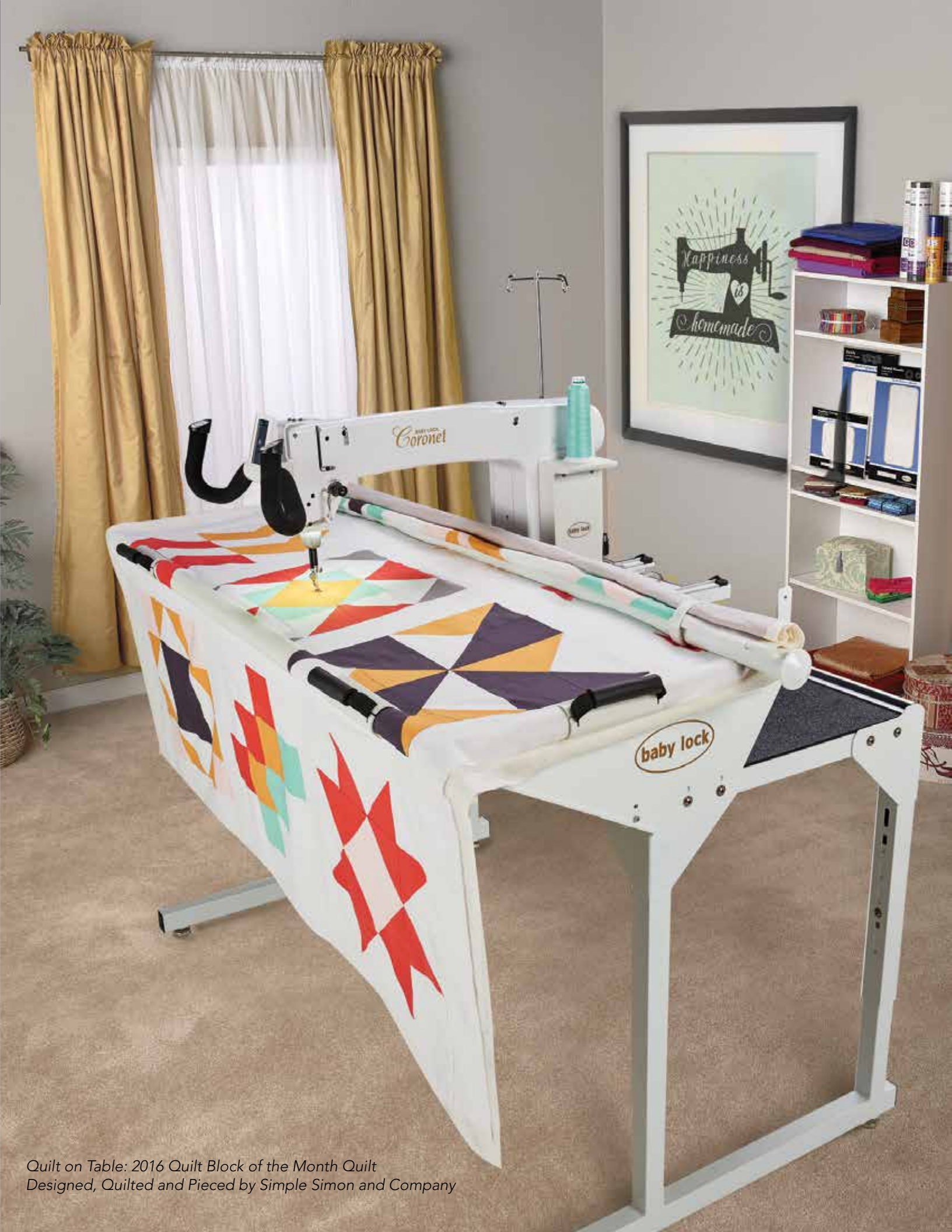
Quilt on Table: 2016 Quilt Block of the Month Quilt Designed, Quilted and Pieced by Simple Simon and Company