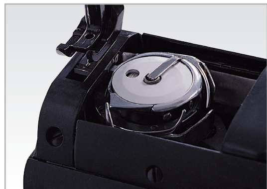
► With a Horizontal Double - Capacity Rotary Hook